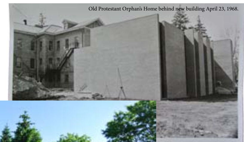
Old Protestant Orphan's Home behind new building April 23, 1968.