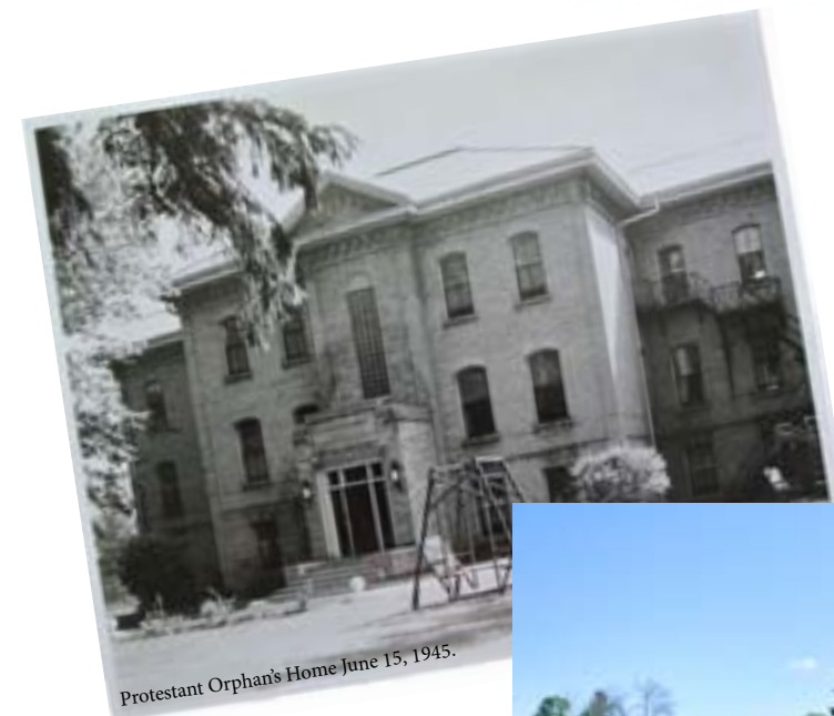
Protestant Orphan's Home June 15, 1945.

And four donors who wish to remain anonymous. While every attempt has been made to ensure accuracy, we apologize for any errors or omissions. Please let us know of any changes.